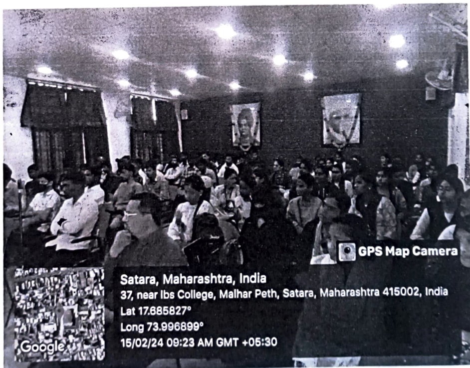
Participant at the workshop on “English & Soft Skills”