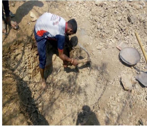
NSS Students digging Toilet Pits at Adopted Village Kushi