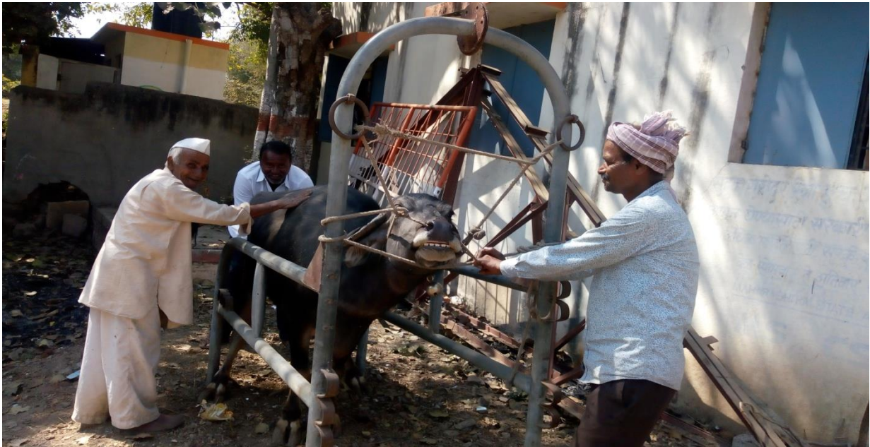
Animal Health Check-up Camp organized in Camp