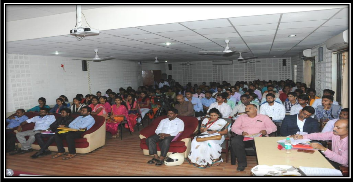
Students Participation in “Pandit Dindayal Upadhyay Rojgar v Udyojkta Melava” ( Maharojgar Melawa) .