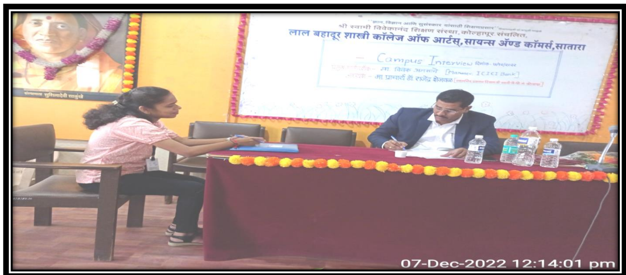
Moment of Students Campus Interview