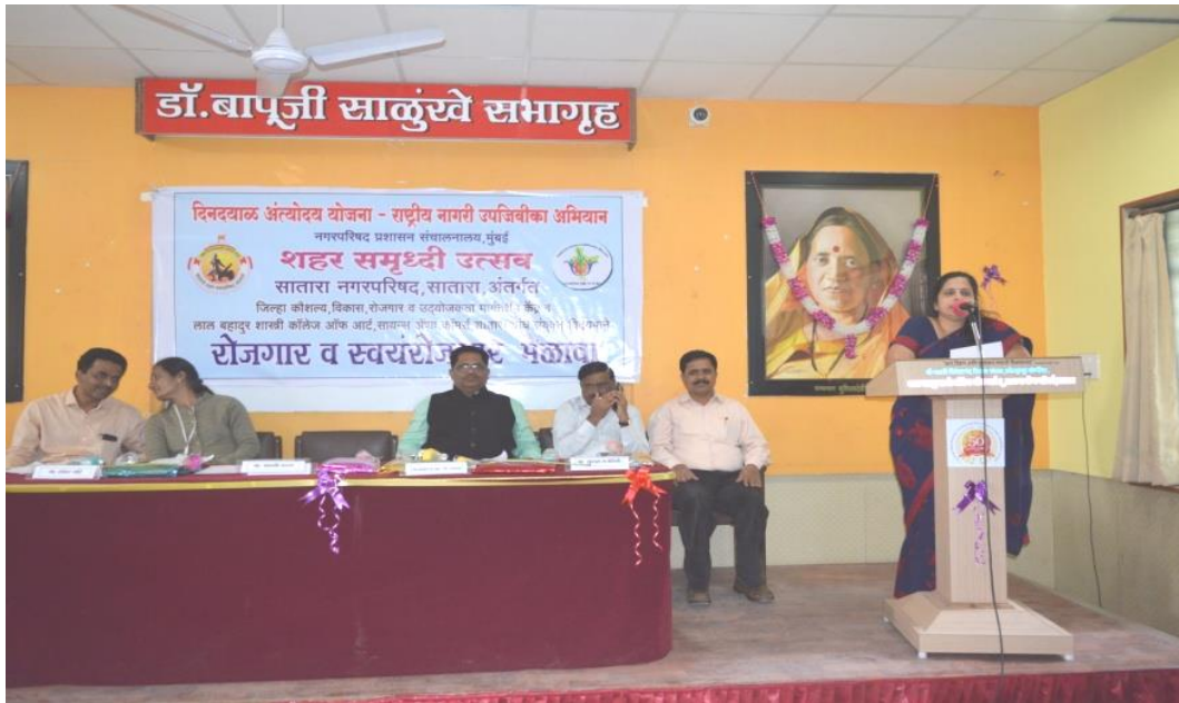
City Mayor Madhavi Kadam express her thoughts in Key note address