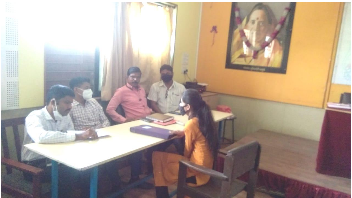
Student Participation in Campus Interview