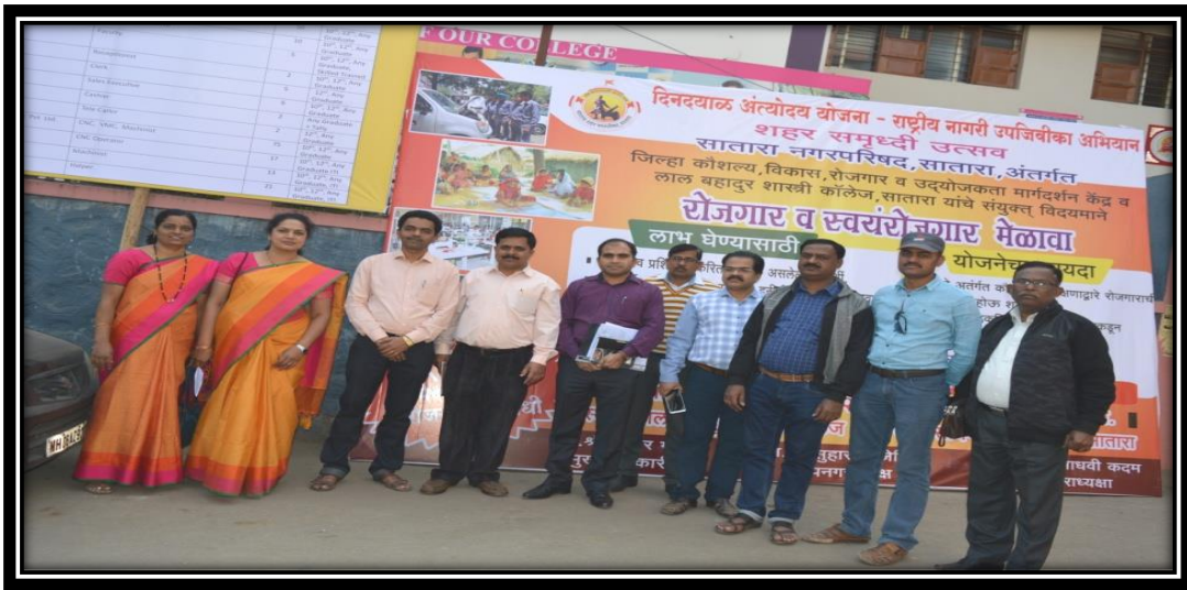
Respected Organizing Team with Job Fair Banner