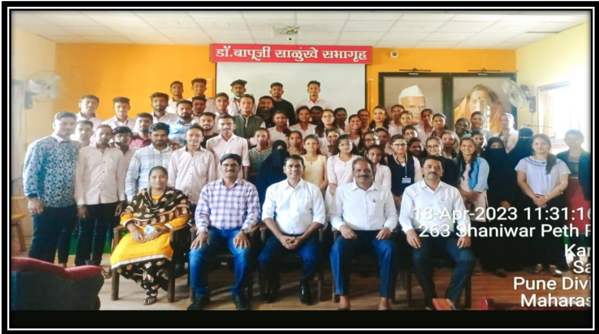
Group Photo of All Participants in Training Program with Trainers