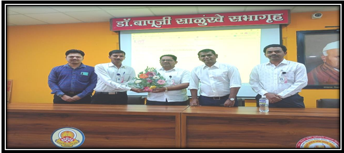
Inaguration of Skill Development Training Program

Global Talent Track Foundation, Pune (G.T.T.F)