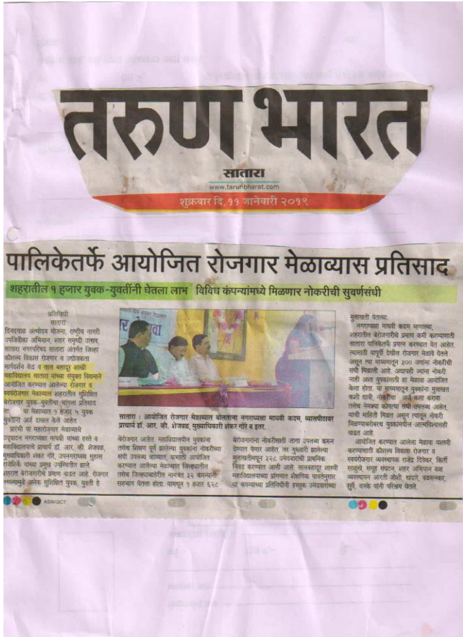
Job Fair -News Papers Clippings