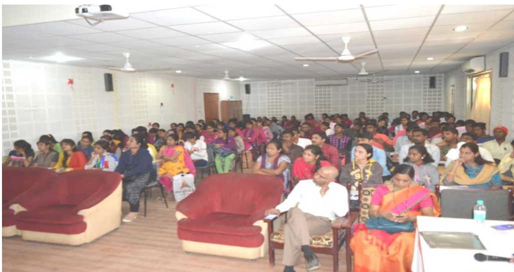
Students Participation in Job Fair ( Maharojgar Melawa)