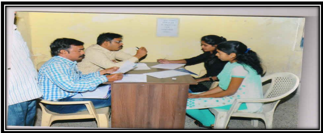
Moment of Campus Interview