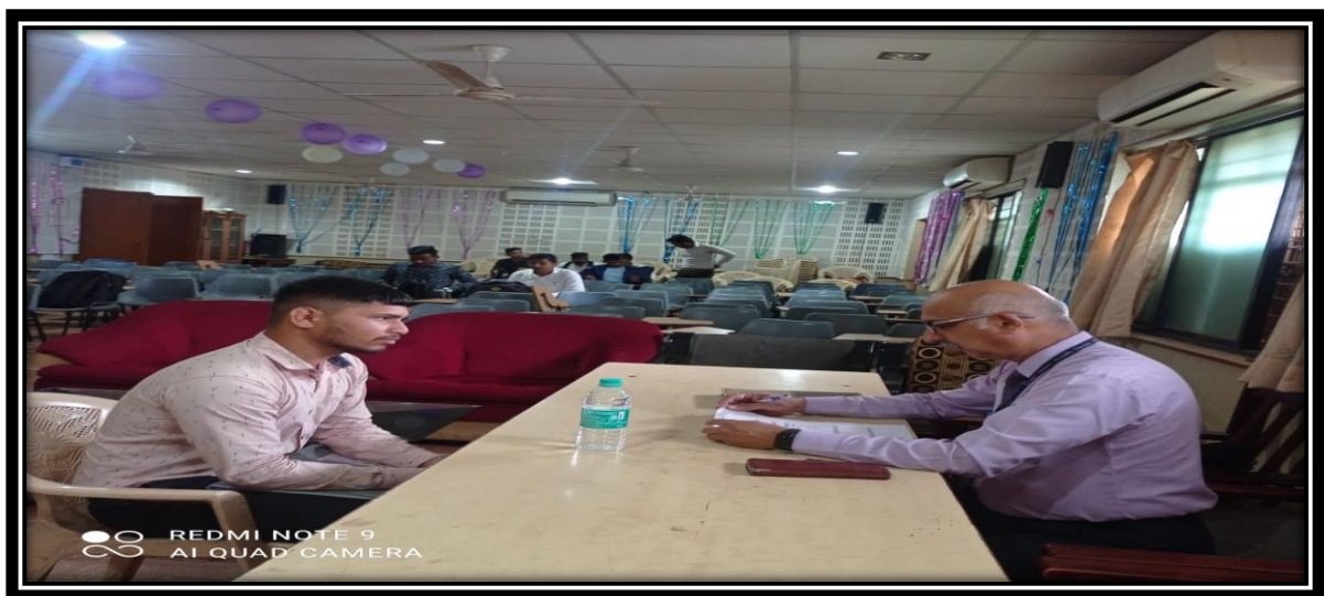
Moment of Students Campus Interview