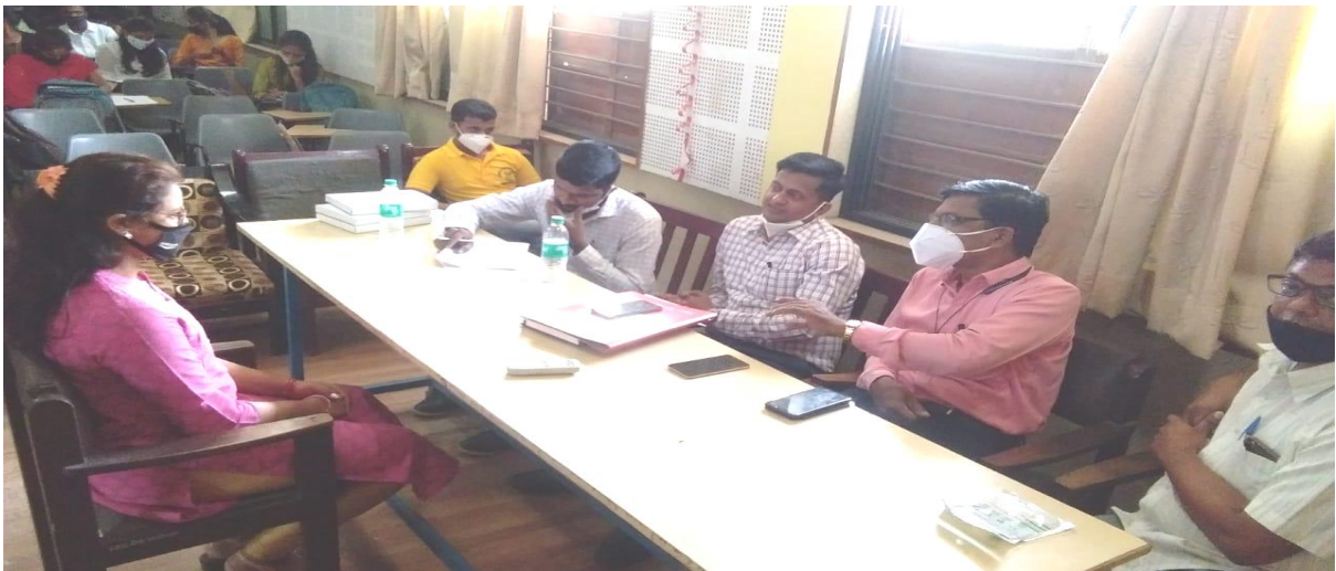
Moment of Campus Interview