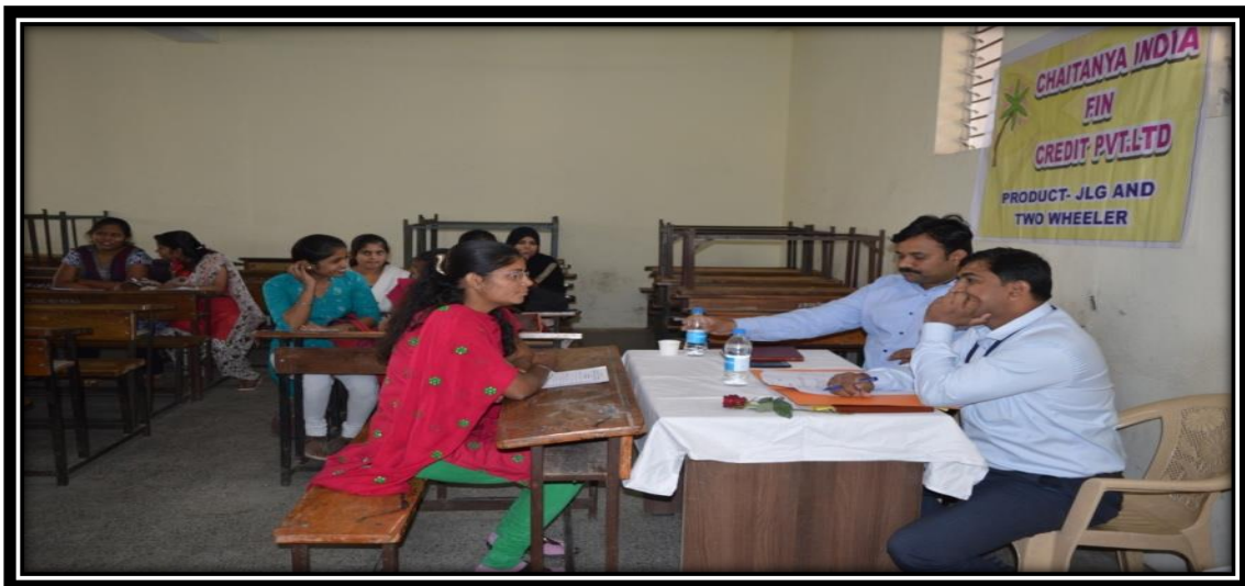
Moment of Campus Interview