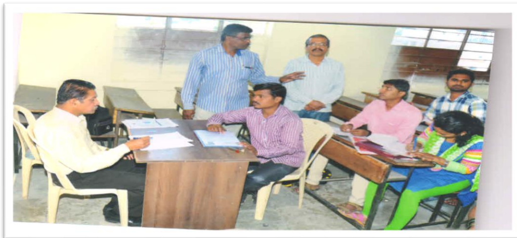
Campus Interview - moment