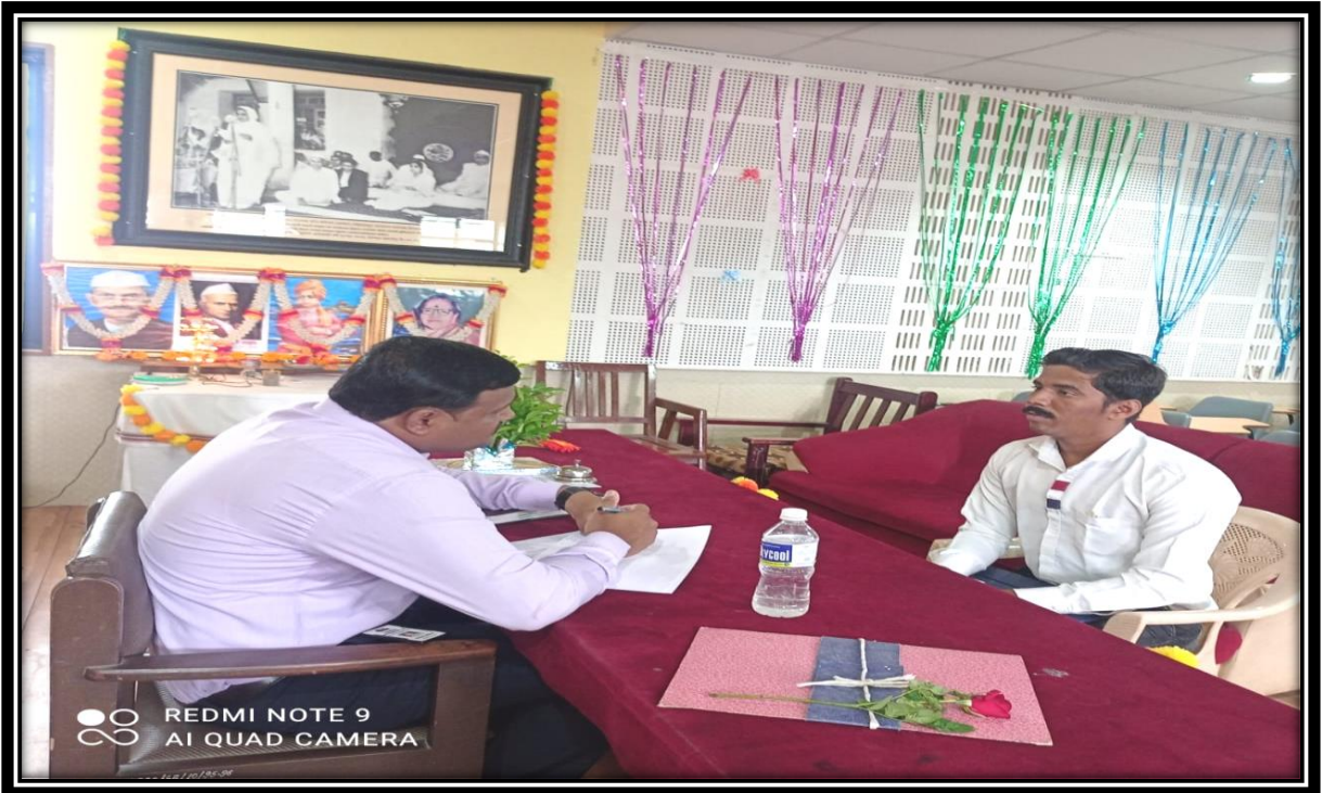
Moment of Students Campus Interview