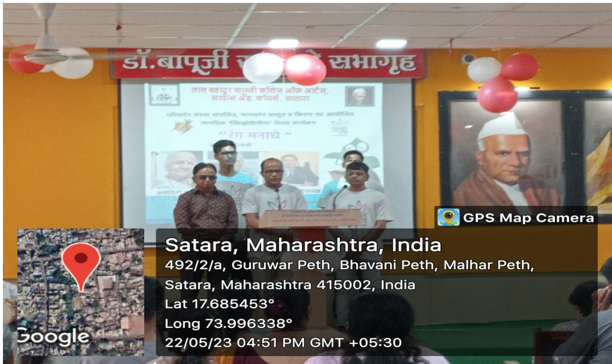
Health Centre and Parivartan Sanstha was organized Programme of 'Rang Manache' on the occasion of Schizophrenia Day (22 nd May 2023)