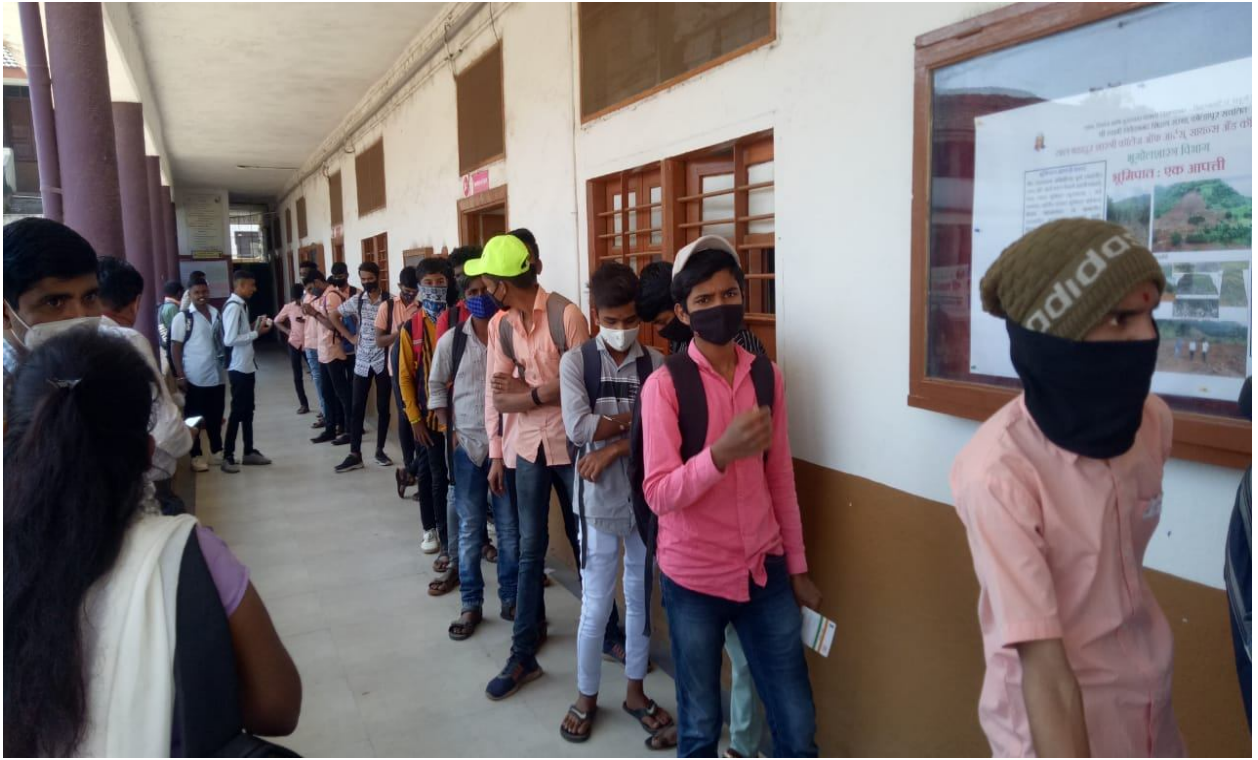
Our College Students was actively participated in Covid-19 Free Vaccination Campaign