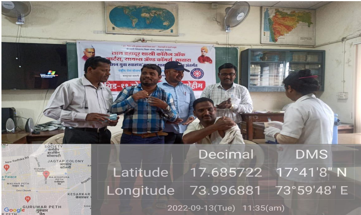
Kasturba Health Urban Centre and L.B.S.College Satara jointly organized Covid-19 Free Vaccination Campaign (13th Sep,2022)