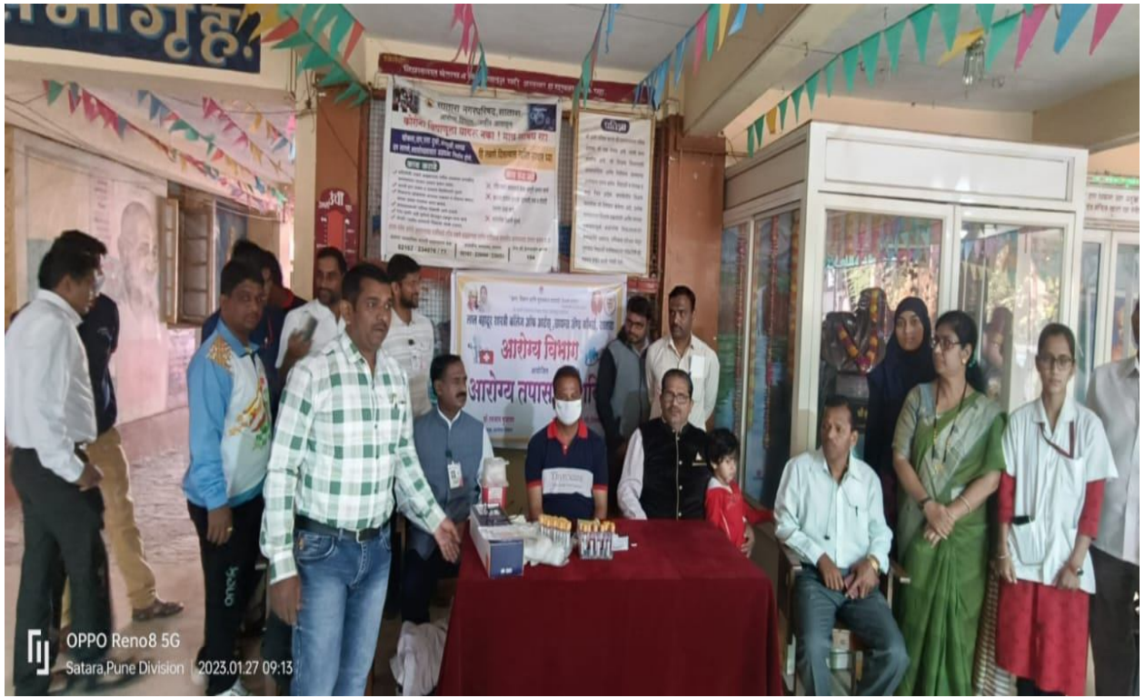
Arogeyam Voluntary Organization and L.B.S.College Satara was jointly organized Health Tests for College students and Faculty (26 th Jan.2023)