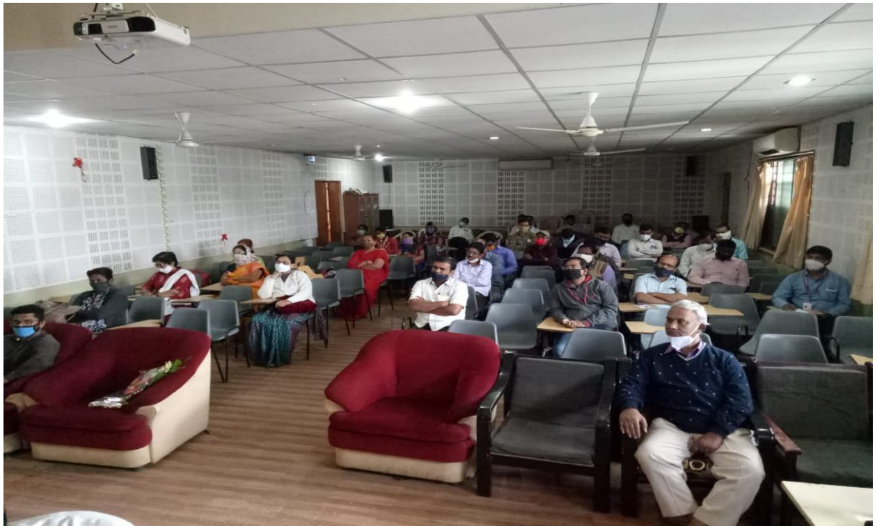
Audience attended one day workshop on Covid-19.