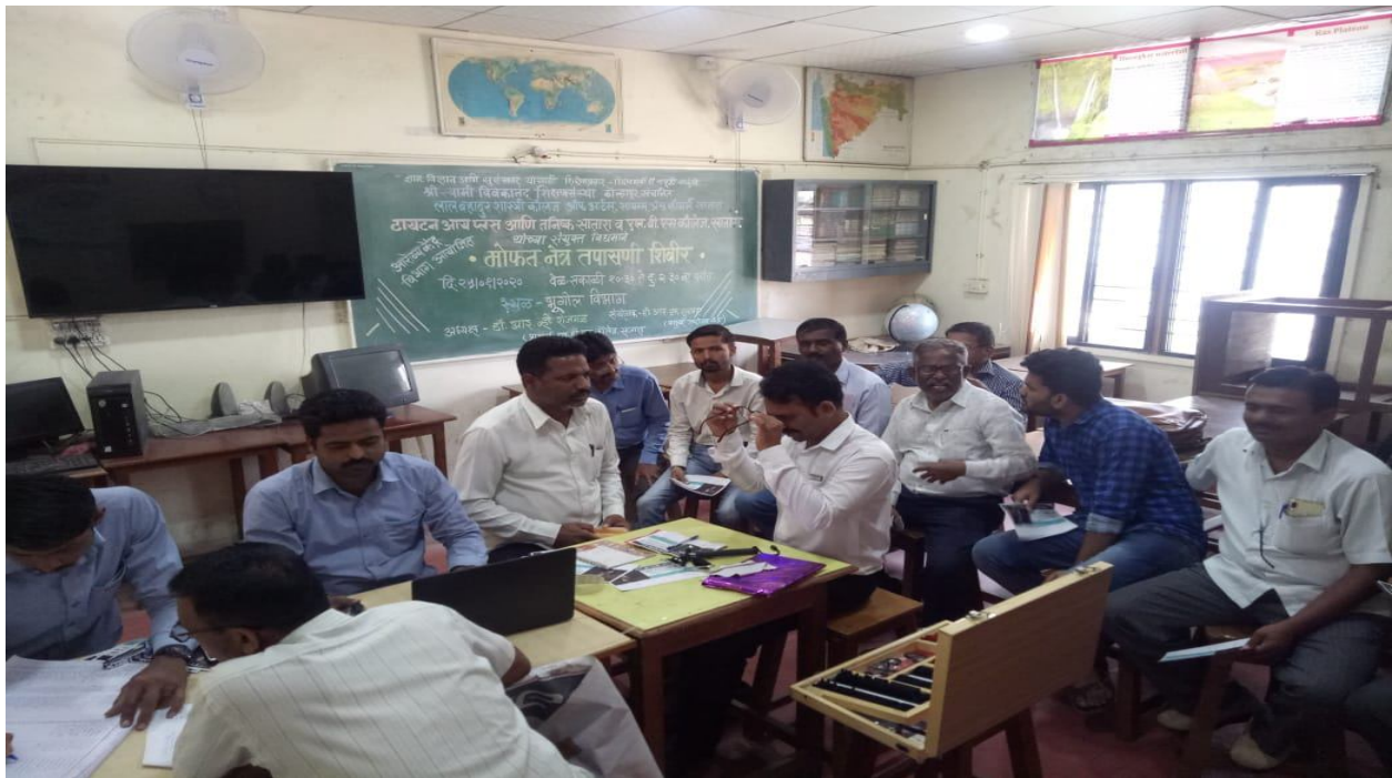
Free Eye Checkup Camp organized by Health Centre in the college (25 th Jan..2020)