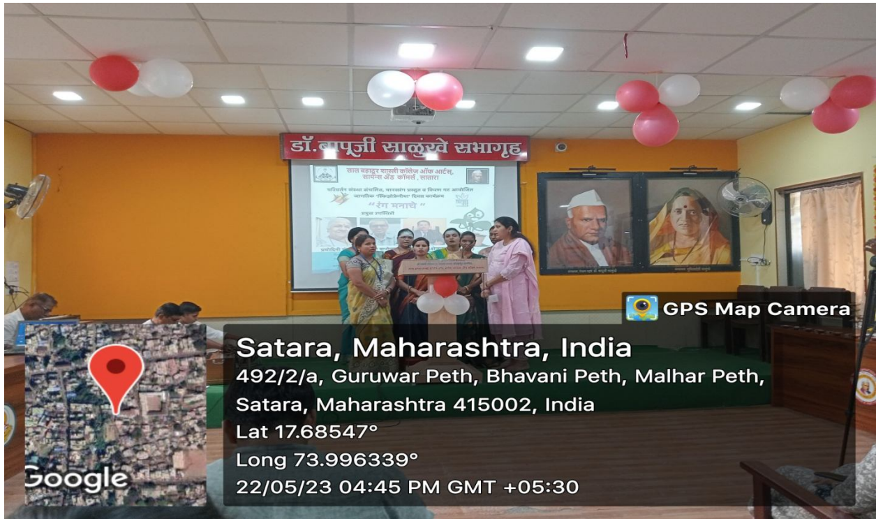
Health Centre and Parivartan Sanstha was organized Programme of 'Rang Manache' on the occasion of Schizophrenia Day (22 nd May 2023)