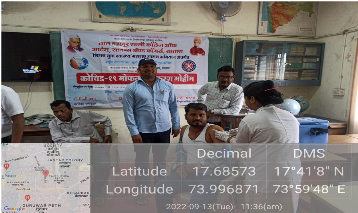
Kasturba Health Urban Centre and L.B.S.College Satara jointly organized Covid-19 Free Vaccination Campaign (13th Sep,2022)