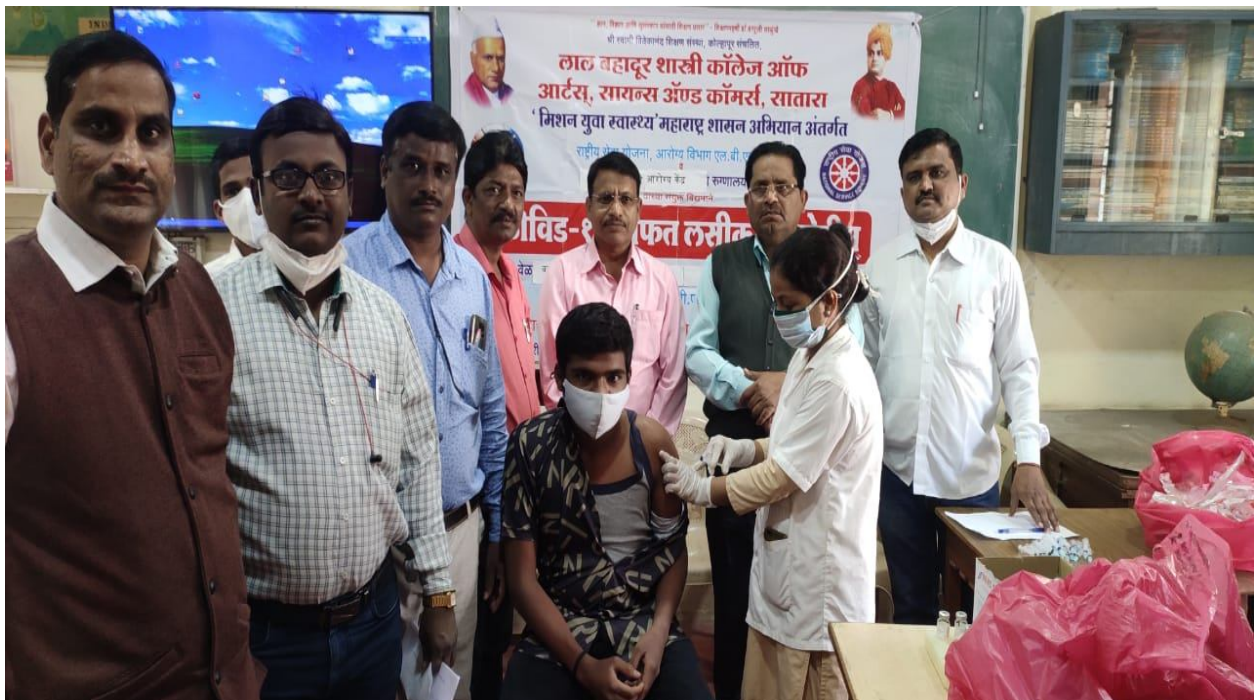
Kasturba Health Urban Centre and L.B.S.College Satara jointly organized Covid-19 Free Vaccination Campaign (2 nd Feb,2022)