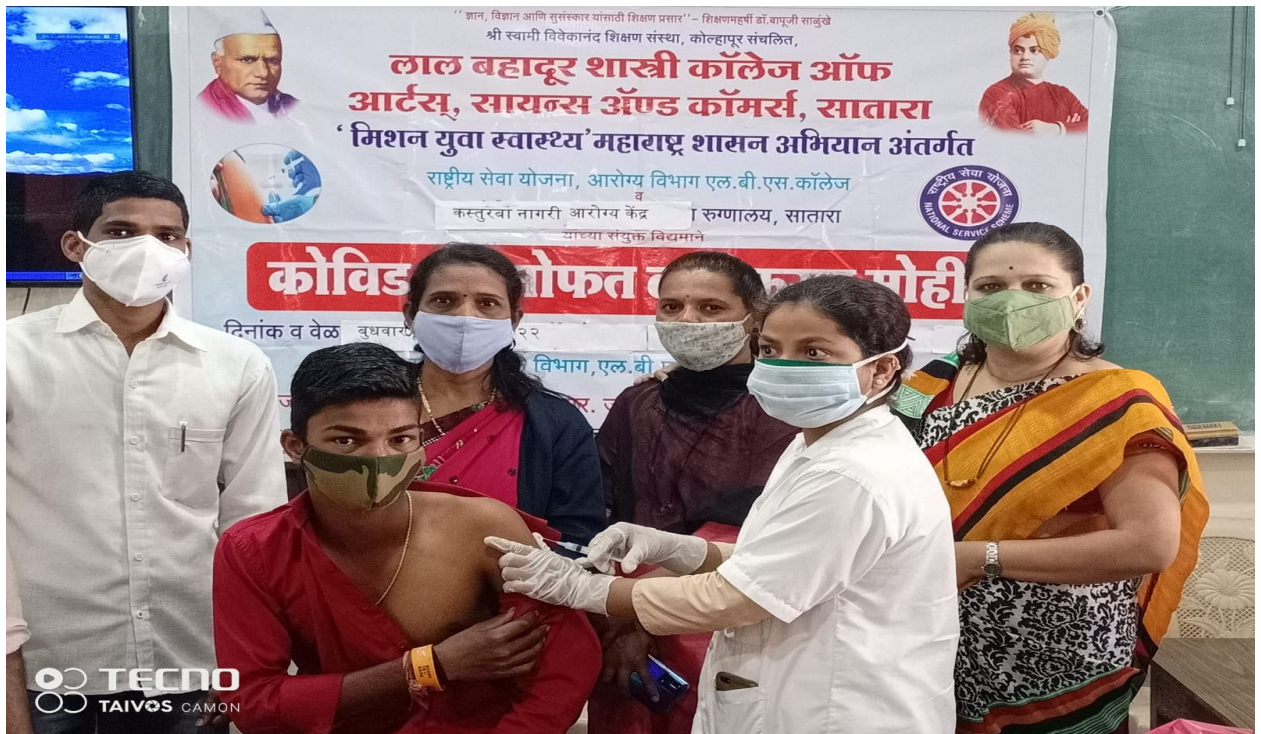
College Student was taken Vaccination in Covid-19 Free Vaccination Campaign