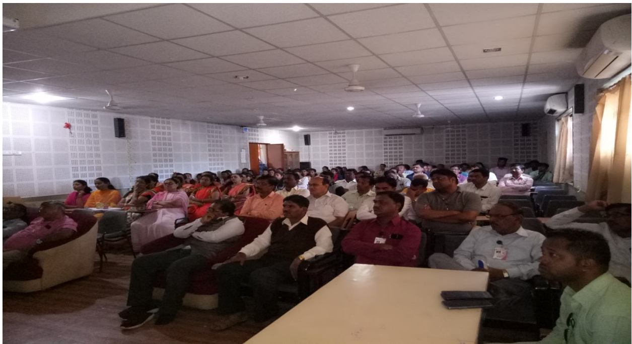
The Audience in the guest lecture on “Heart Diseases and to Care of the Heart on the occasion of World Heart Day (29th Sep.2019)