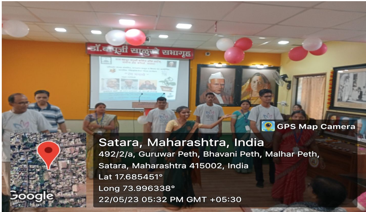
Health Centre and Parivartan Sanstha was organized Programme of 'Rang Manache' on the occasion of Schizophrenia Day (22 nd May 2023)