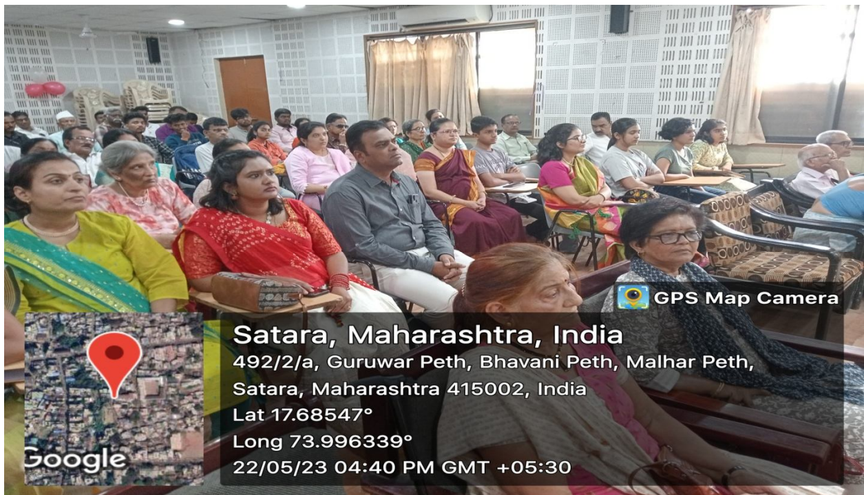
Participated Audience in the Programme of 'Rang Manache' on the occasion of Schizophrenia Day (22 nd May 2023)