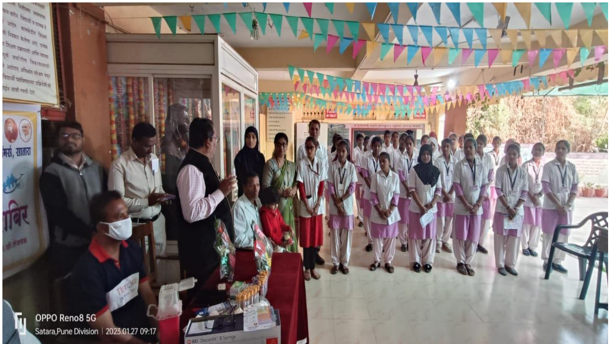
Arogeyam Voluntary Organization and L.B.S.College Satara was jointly organized Health Tests for College students and Faculty (26 th Jan.2023)