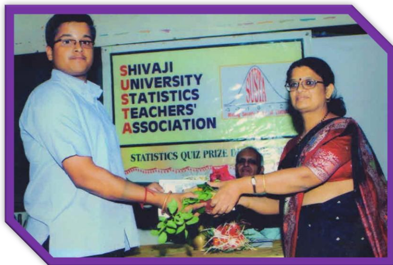
Quiz Competition 2016-17 Conducted by Statistics and Mathematics Departments. 11 th Feb 2017