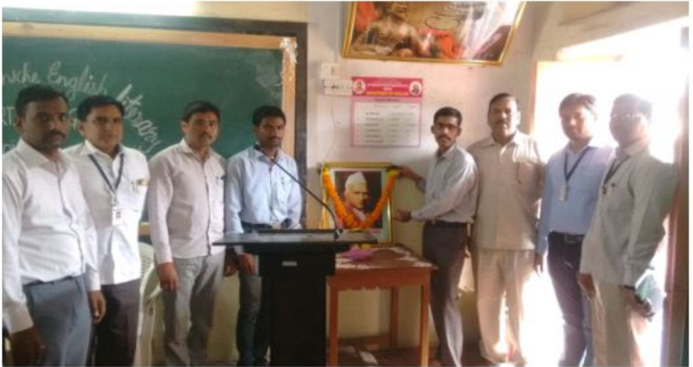
Inauguration of "Interaction with Alumni"