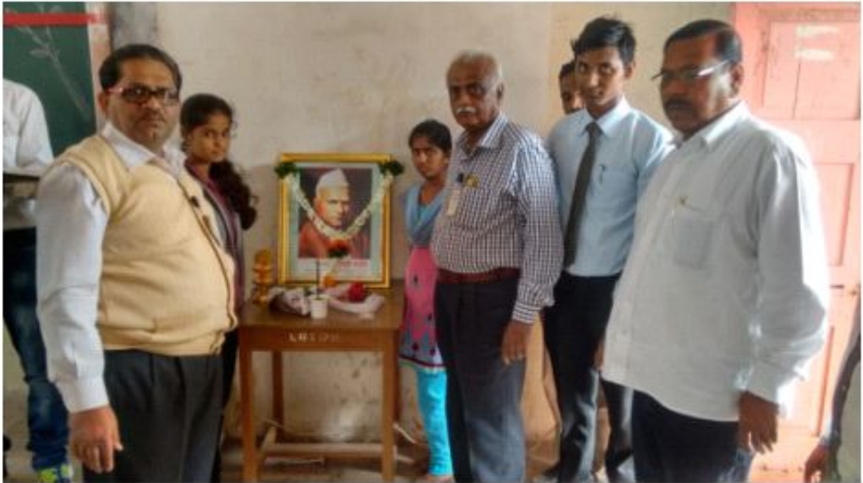
Inaugural Function of Dr. Bapuji Salunkhe English Literary Association