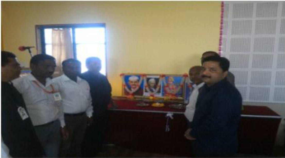
Inauguration of Workshop on “English for Competitive Exam”