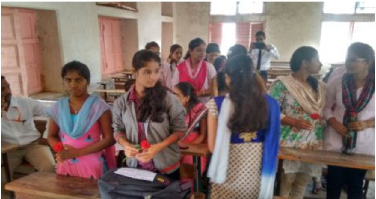
B.A.III Students Welcomes B.A.I year Students