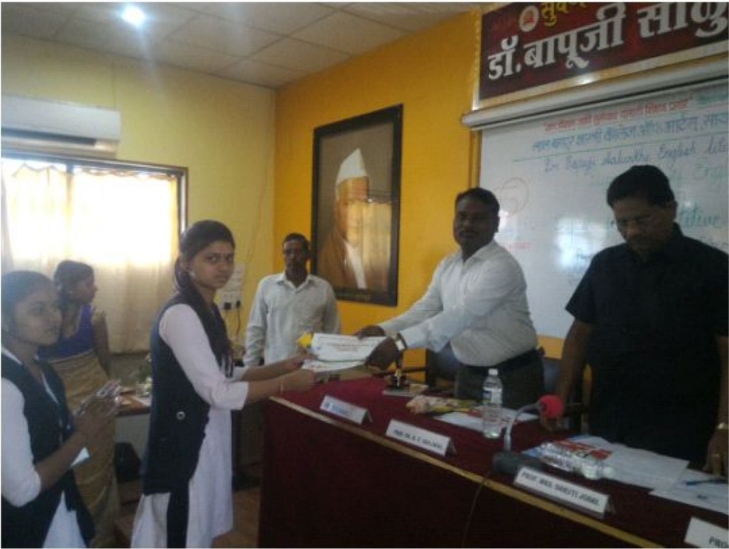
Prize Distribution of "Best of Waste Competition"