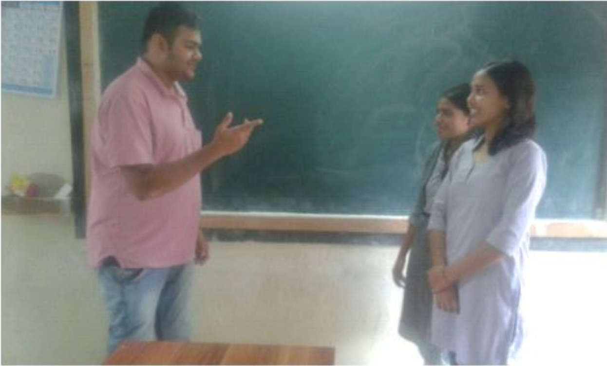
Role-playing activity "First Day in College" – Teacher-Student Conversation