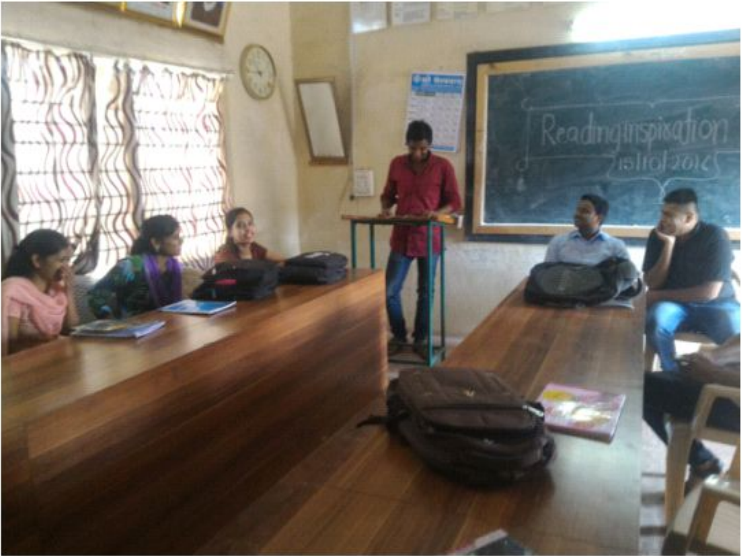
Celebrating "Reading Inspiration Day" on 15 th Oct.2016 to pay Tribute to Dr. A.P.J.Abdul Kalam