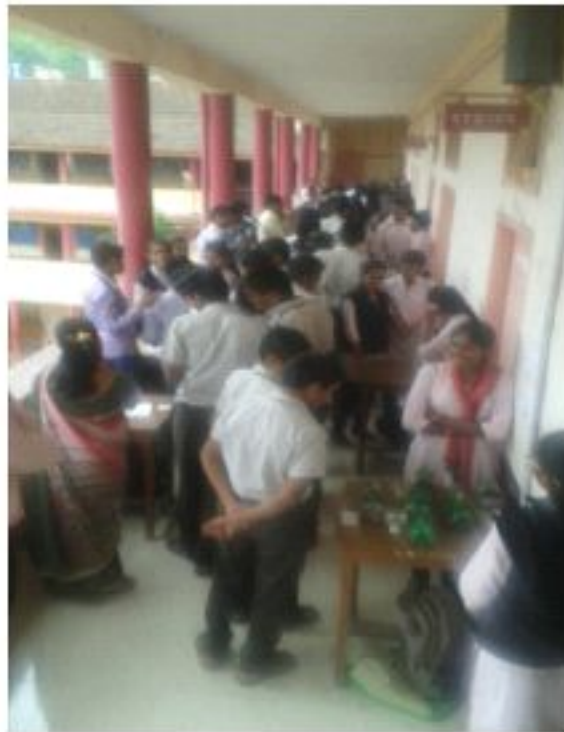
“Best of Waste” Competition